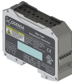
FTX-910-PWR+ Temperature Transmitter